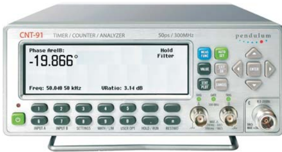
Figure 1: Display showing phase value, frequency, attenuation V_A/V_B , and auxiliary parameters.

When adjusting a frequency source to given limits, the graphic display gives fast and accurate visual calibration guidance.