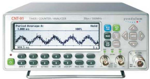
Figure 5: Display showing the trend (signal over time) of sampled data.