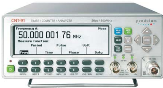
Figure 2: Measure function selection menu, shown with measured results.