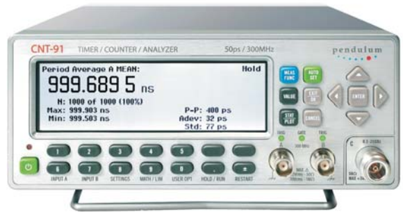
Figure 4: Display showing different statistical parameters viewed at the same time.